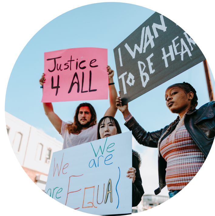
Abuse and Trafficking