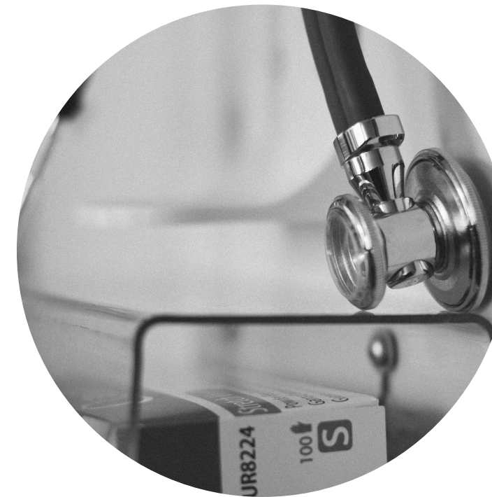
No Long- Term Studies